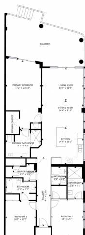
Seacrest Residences 2

GRAND INTERNAL AREA FLOOR 11, 1200 SQ. FT. TOTAL: 1200 SQ. FT.