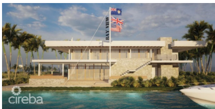
The Sports and Leisure Facilities Plan